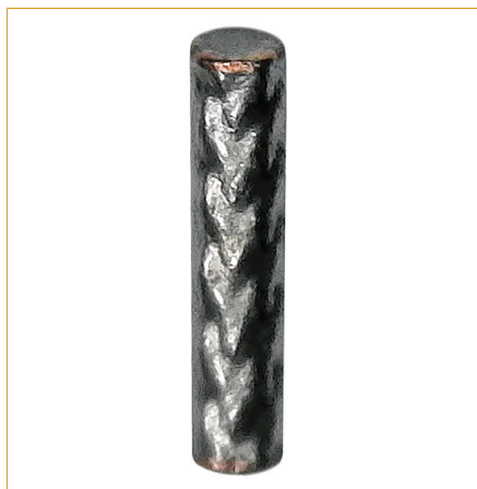
FIGURE 3. Braided solder column developed and patented by Topline.